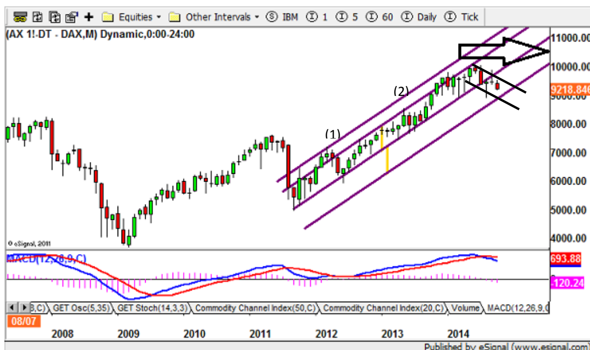
Figure 1: DAX future monthly chart

The above is the monthly chart for the German Index DAX. It is important to have a look at it right now because many pieces of information can be derived from it. Firstly that the index has been diligently inserted in a channel for almost three years and that it moved out upwards only in two instances, in 2012 and late 2013: those two instances resulted more in a bull trap rather than a true acceleration of the trend.