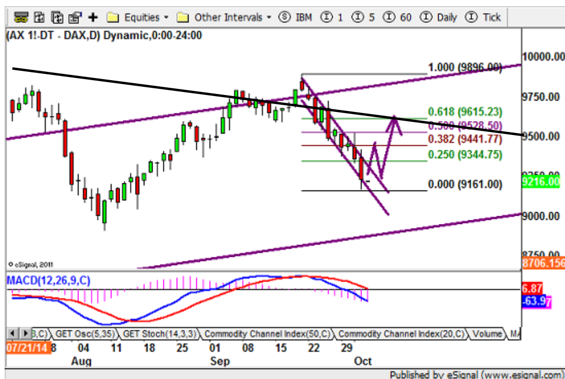
Figure 2: DAX future daily chart

Let's look at the daily chart then and see if we can get some indications.