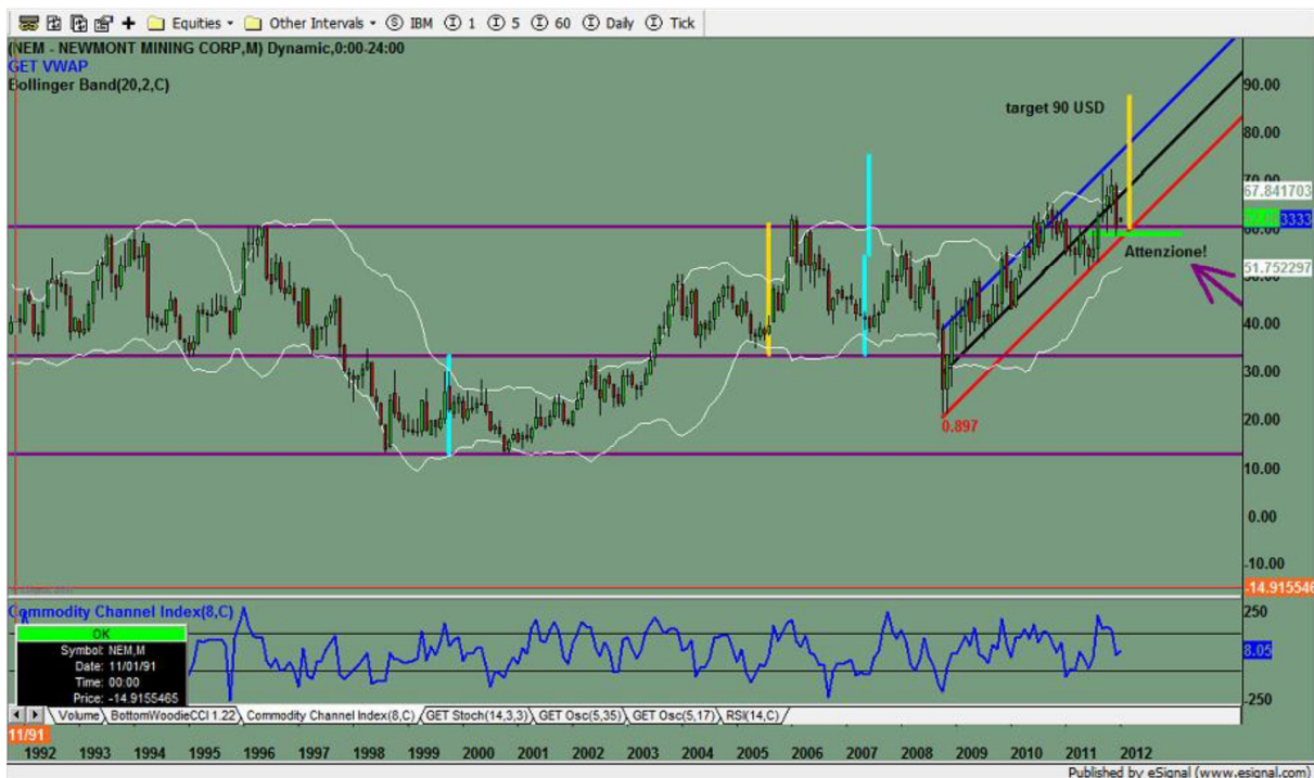
Newmont Mining Monthly chart

Chart Analysis: looking at the monthly chart and therefore on a longer term than usual it is possible to note how Newmont Mining (ticker: NEM) in the last 20 years is inserted in a fairly big sideways channel. From 2009 then the stock is moving upwards in a perfect channel: such channel is formed using a set of regression trend lines.