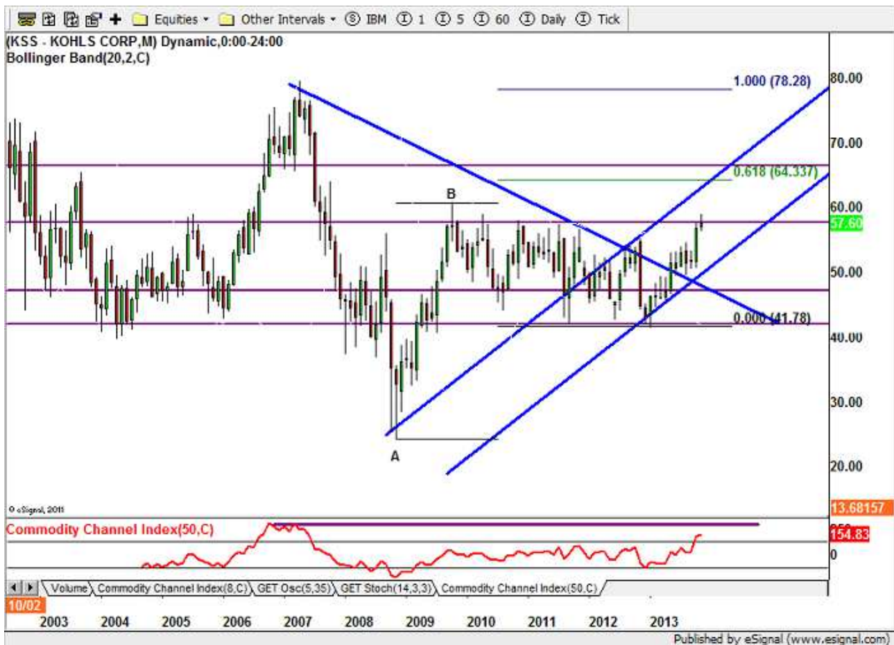
Figure 1: Kohl's (bloomberg ticker: KSS) monthly chart

“Shop until you drop” will help Kohl's hit double top?