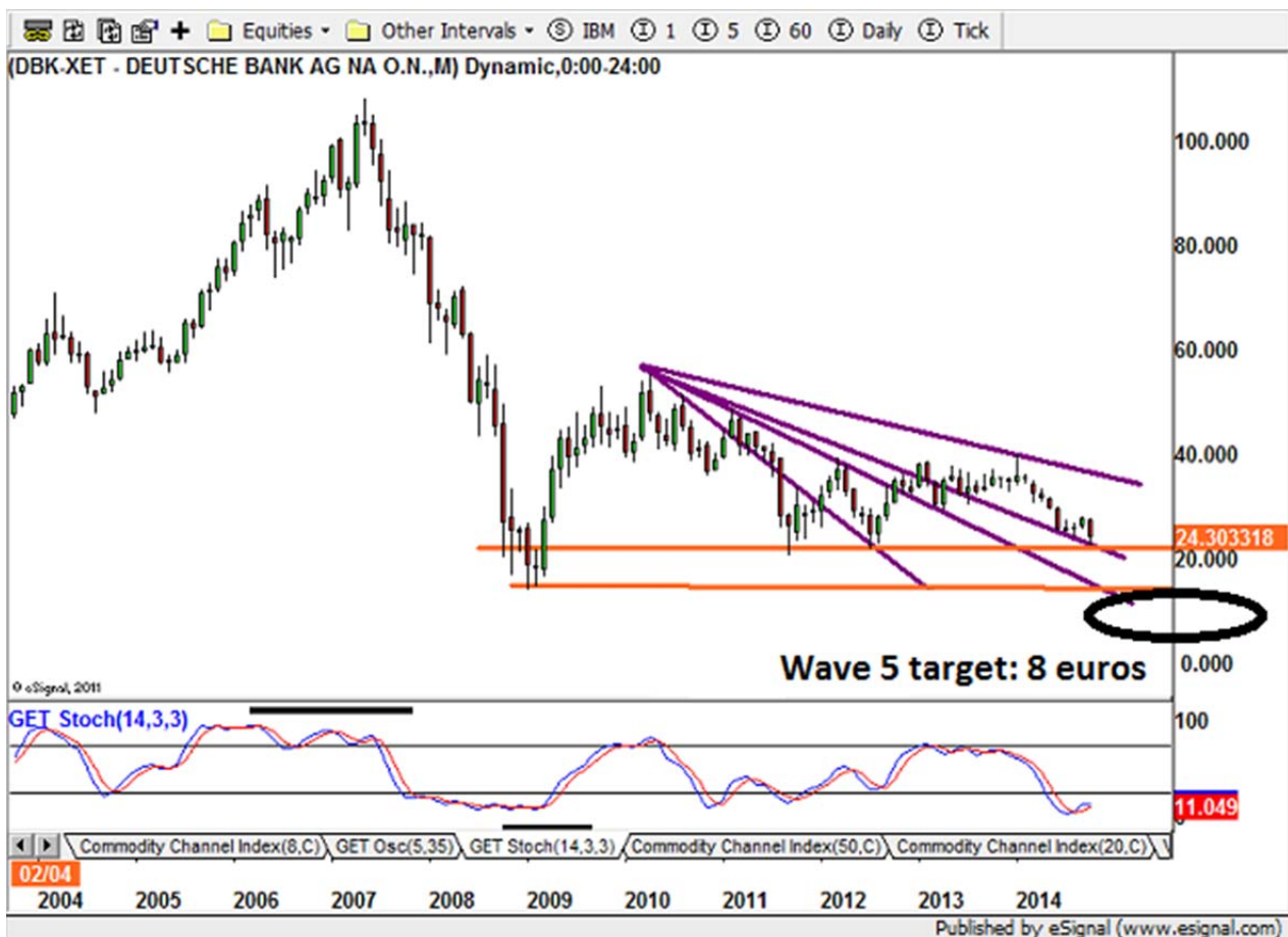
Figure 2: Deutsche Bank monthly chart

Let's now draw some simple trendlines to the chart above and see what we can learn. See below.