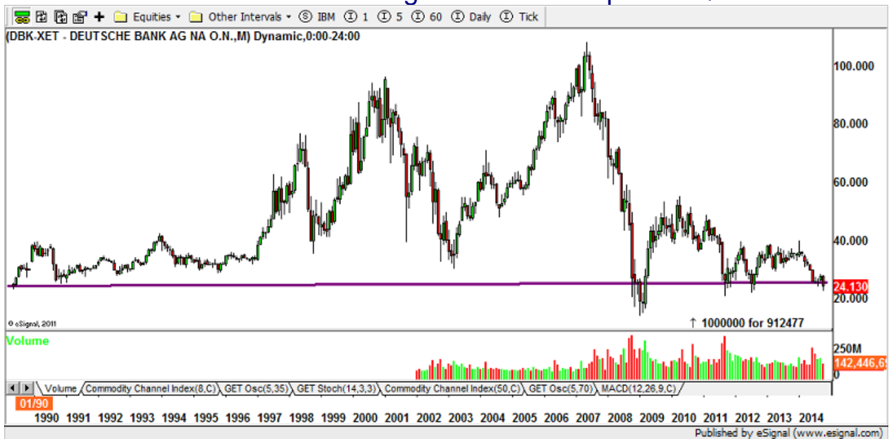
Figure 1: Deutsche Bank monthly chart

The above chart is the monthly of Deutsche Bank. I think it is interesting to have a look at some European banks stocks as we are fast approaching October 26 th , when the ECB will release the results of the Asset Quality Review (AQR), a test as the name suggests, to evaluate the quality of major European banks. It is well known, or at least it should, that one of the most troubled bank in Europe is not Unicredit, as many would think, but the German champion: one of the main concern is the amount of leverage that this bank still has, which is similar to a pre 2009 level. At the link a bloomberg article ( http://www.bloomberqview.com/articles/2012-09-16/will-germans-pick-up-the-tab-for-deutsche-bank-too- ): it is true is from 2012 but nevertheless things haven't changed.