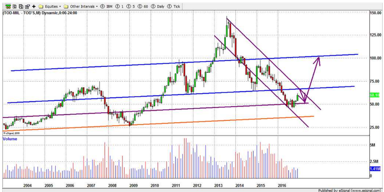
Figura 3: TOD'S secondary scenario

In both my scenarios I am not a buyer at these prices but wait to see how the situation evolves. Since the charts presented are monthly, it is possible that I will have to wait sometime before making an entry; my ideal time cluster is to buy the stock after February 2017.