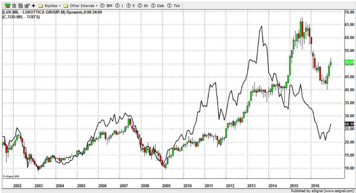
Figura 4: monthly chart comparison TOD'S - LUXOTTICA

At the chart above there is LUXOTTICA in candlesticks while TOD'S is in lines. Clearly LUXOTTICA is in a bullish trend as it even didn't violate the 2014 low. Of course the stock may violate those lows at any time in the future, but the overall situation is very different from TOD'S which instead violated such lows, strongly.