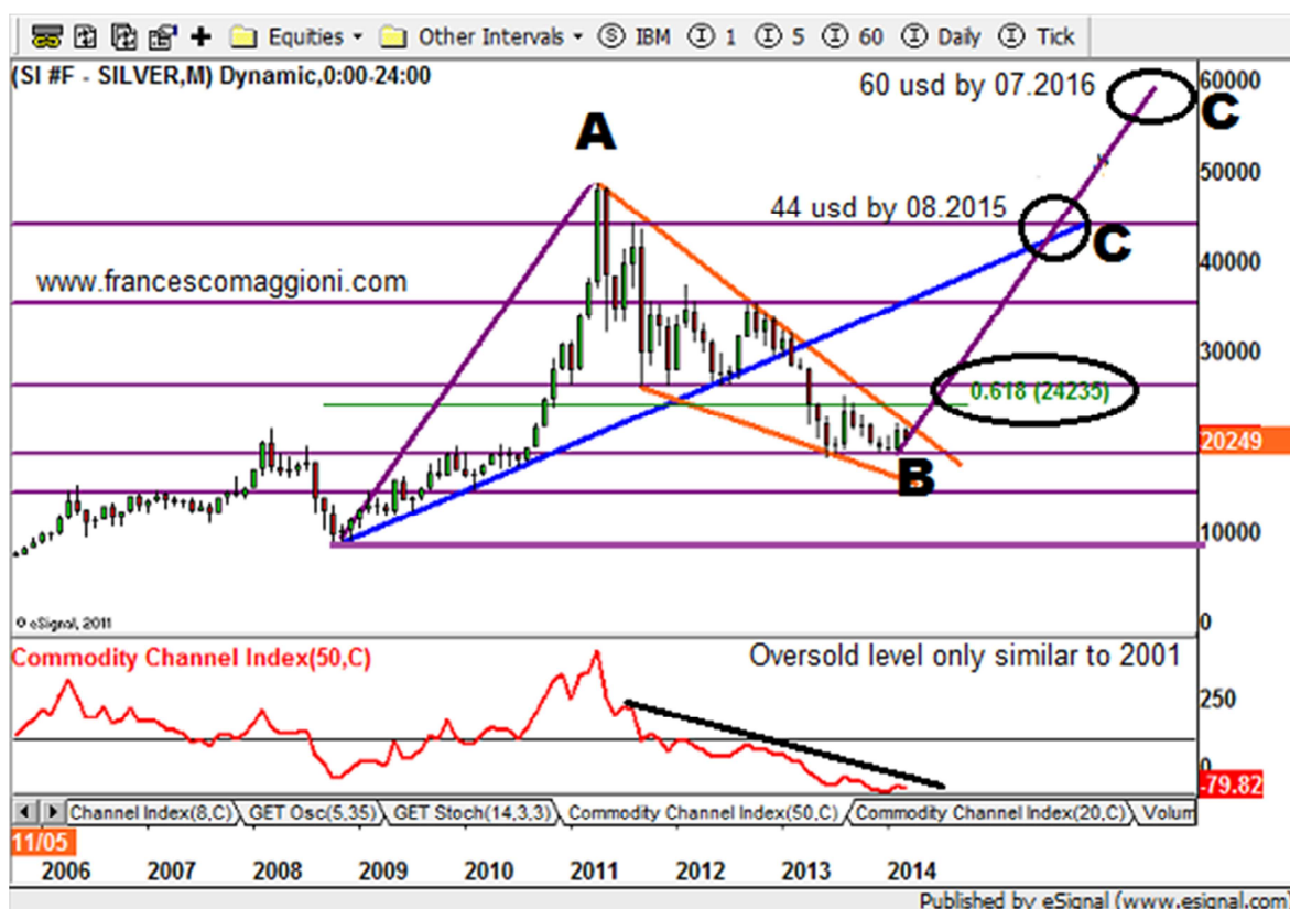
Figure 1: EURUSD monthly chart

The above is the monthly chart of Silver. Similar to Gold, it has been not a darling for most of investors who kept it until recently, wasting a chance to make a remarkable profit in 2011.