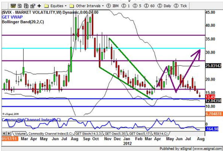
VIX Index weekly chart

After arriving at the first resistance, the VIX started again to move down and right now it looks very compressed. I only added at this chart the blue lines, which are the all time lows that the VIX did in 2007. If equities will even moderately continue their path to higher high, it will very be that VIX will arrive at 10. No sign of inversion yet. However it is possible to notice that once the level of 16 is broken, VIX goes swiftly to its next resistance, 27. Even in this case, Bollinger Bands are horizontal.