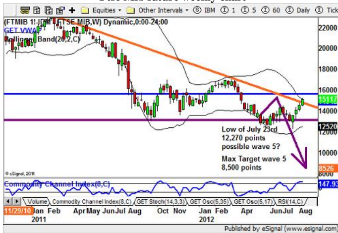
Ftse Mib future weekly chart

The Italian index on July 23 rd did a lower low at 12,270; March 2009 low was 12,370 and therefore this recent low must be labeled so far as potential end of wave 5. It is also above the trendline that link previous high and approaching the upper Bollinger band, signaling for this index too (see Eurostoxx) a potential trend inversion in place. However a trend inversion will be confirmed only when the index will break the March 17,200 points high. Before resuming the bearish trend the index is expected to achieve the 15,600 points (resistance, blue line). No sign of trend inversion at this stage, on a candlestick level.