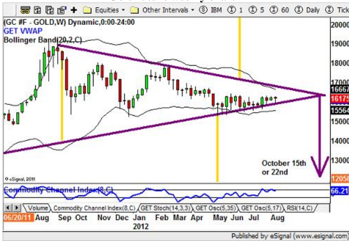
Gold future weekly chart

Gold is feeling the lower line of the wedge and again, nothing significant to report on Gold or Silver. It is valuable to take note that the two lines of the wedge cross each other on October 15 th or October 22 nd which, in the whole year, is quite an important date.