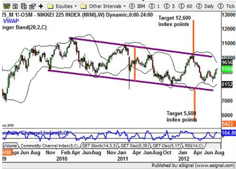
Nikkei 225 index weekly chart

Higher lows and higher high are signaling a short term bullish behavior set inside a major downward trend. Too early to call it a trend inversion, too strong the bearish trend to call it its end.