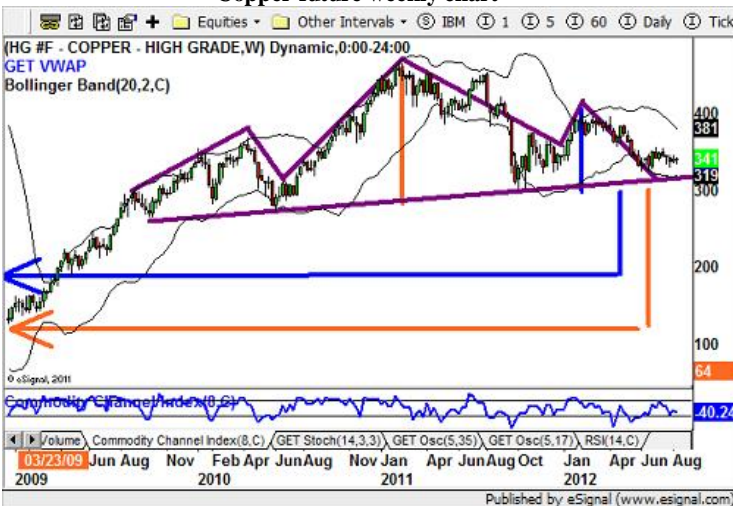
Copper future weekly chart

Copper is silently and slowly behaving as expected, doing lower highs but still defending with all strength possible the dynamic support set with the neckline. Among other instruments herewith presented, this is the cleanest and earnest one that to me is showing the real situation in the equity markets.