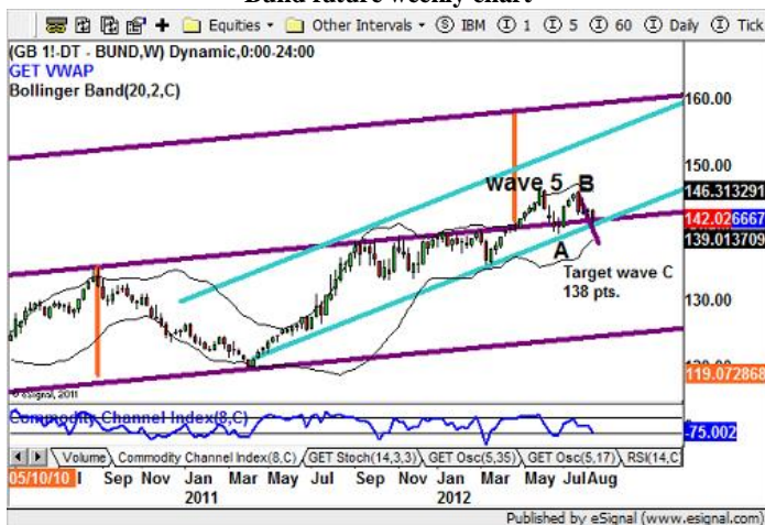
Bund future weekly chart

Even though in the broader picture the Bund is still very well inserted in an upward movement, we cannot avoid but notice short term weakness, such as the termination of a five wave impulsive pattern, followed by an ABC (still in formation) pattern, which has its potential target at 138 points. On the other hand, last week candle retested the upper line of the long term bullish channel (purple line) AND the lower line of the shorter term channel (light blue line) which is a sign that cannot be left aside. Weakness will be confirmed only with the breaking of last week low 140.78, or even better, the 139.72 low from the week of June 25 th . Last week candle is showing that there are lots of buyers around the 139-140 level.