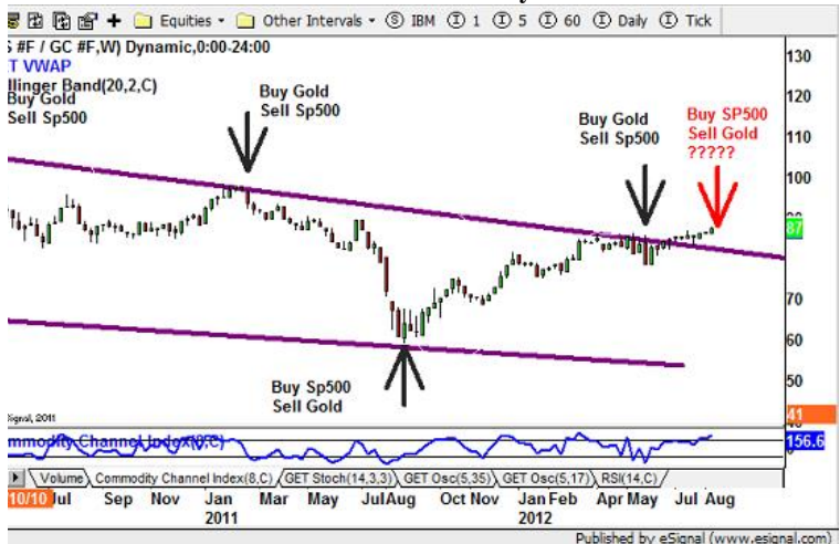
Ratio SP500 / Gold weekly chart

The ratio is giving a signal which is basically different from any other instrument we looked at in this report.