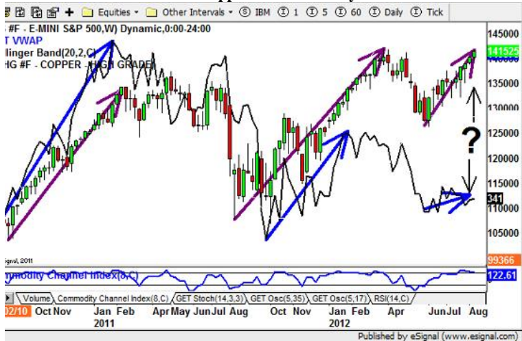
SP500 and Copper futures weekly chart

My favorite chart here. No news is good news and Copper is still weaker than the Sp500.