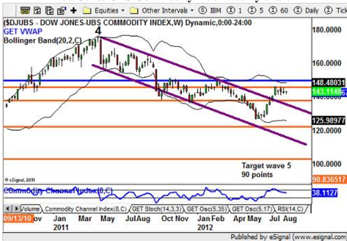
Dow Jones UBS Commodity index weekly chart

Similarly with the equity indexes, and in particular the European ones, Commodities broke the downward channel, tested a significant resistance and now are ready to probably continue their movement up targeting the next static resistance, 149 points (blue line).