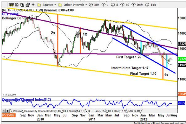
EURUSD weekly chart

The only addition to my chart is the blue channel, which is the short term pattern of the exchange rate, inserted in a broader, however bearish, movement. If equities will continue in their upward movement, correction of the exchange rate could arrive at 1.26 or even (less probable) 1.30 before resume the bearish movement.