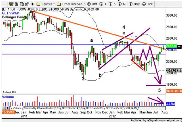
Eurostoxx 50 future weekly chart

Similar to other equity indices, Eurostoxx is approaching significant resistance, namely the 2500 points threshold. It is valuable to note that it felt the trendline that linked the previous highs (orange line) even though now the index is above it. Currently it is also outside the Bollinger bands which is a signal of both a stretched movement or a potential band surfing (continuation of upward movement). Volume is not supporting this leg up.