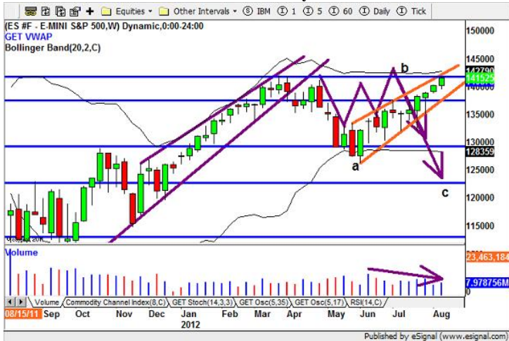
SP500 future weekly chart

The index continued in its bullish trend despite the weekly doji candle that materialized on July 8 th and now arrived basically at April high. However you can see that Bollinger bands are horizontal signaling, at this stage, a mere sideways market. However no sign of inversion is in sight. Interesting to notice that the time count since November is the following: Nov to Apr high is 18 weeks; Apr to May low is 9 weeks (50% retr.); May to today's high is 11 weeks, 125% of the previous movement, and closer to 61.8% of the previous upward movement. We have left only one or two weeks and only after those we will be able to say if this is an impulsive movement, or to confirm this as a corrective movement. Volume is not following this leg up. To me this is a corrective pattern. Be careful.